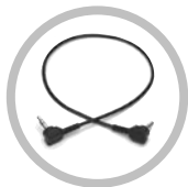
mini-to-mini cable (included with AirHead)