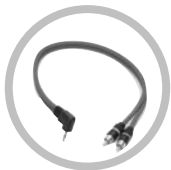
portable cable, mini-to-RCA plugs